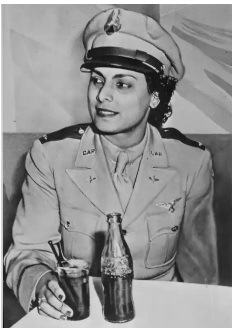
Lt. Willa Brown

First African American woman to earn a pilots, and commercial license (US), and is responsible for training over 200 Tuskegee Airmen and instructors.