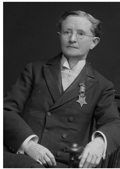
Dr. Mary Walker

The first official female soldier to join the U.S. Army as the Director of the WAC. She also played a key role in the integration of females into the permanent military force.